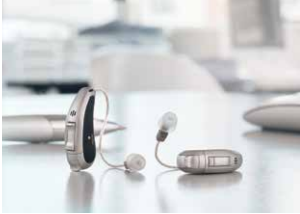
Wireless CROS/BiCROS is ideal for patients with an unaidable hearing loss in one ear.